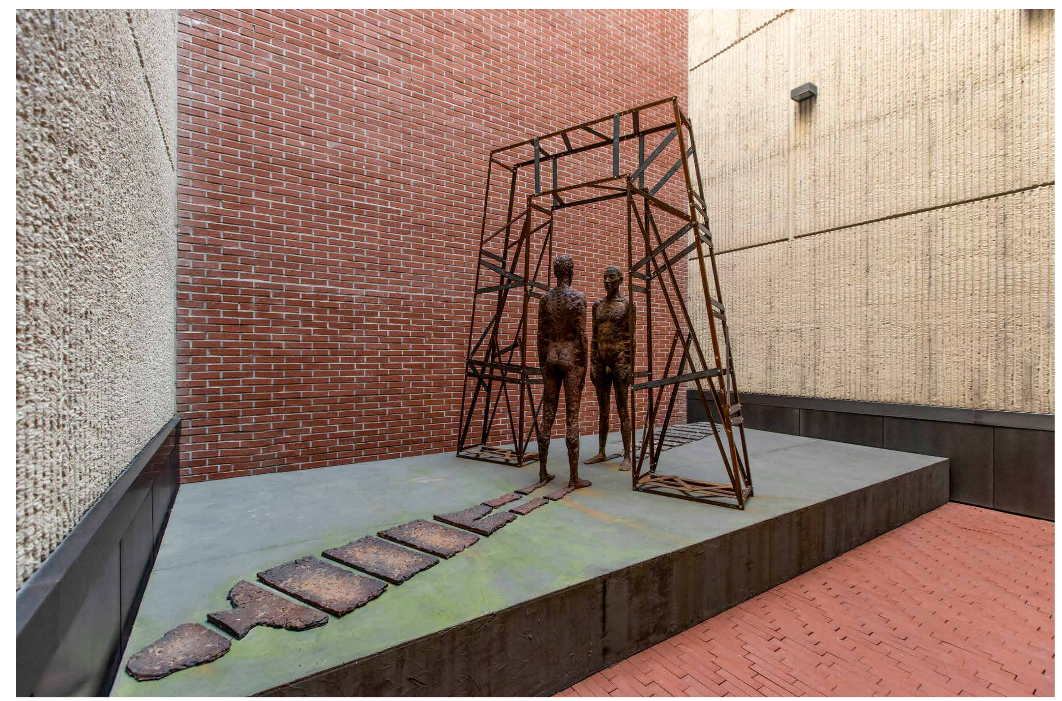
And They Never Gave a Hug, bronze, iron beam, 750*280*350cm(h), 2020, Seosomun Shrine History Museum