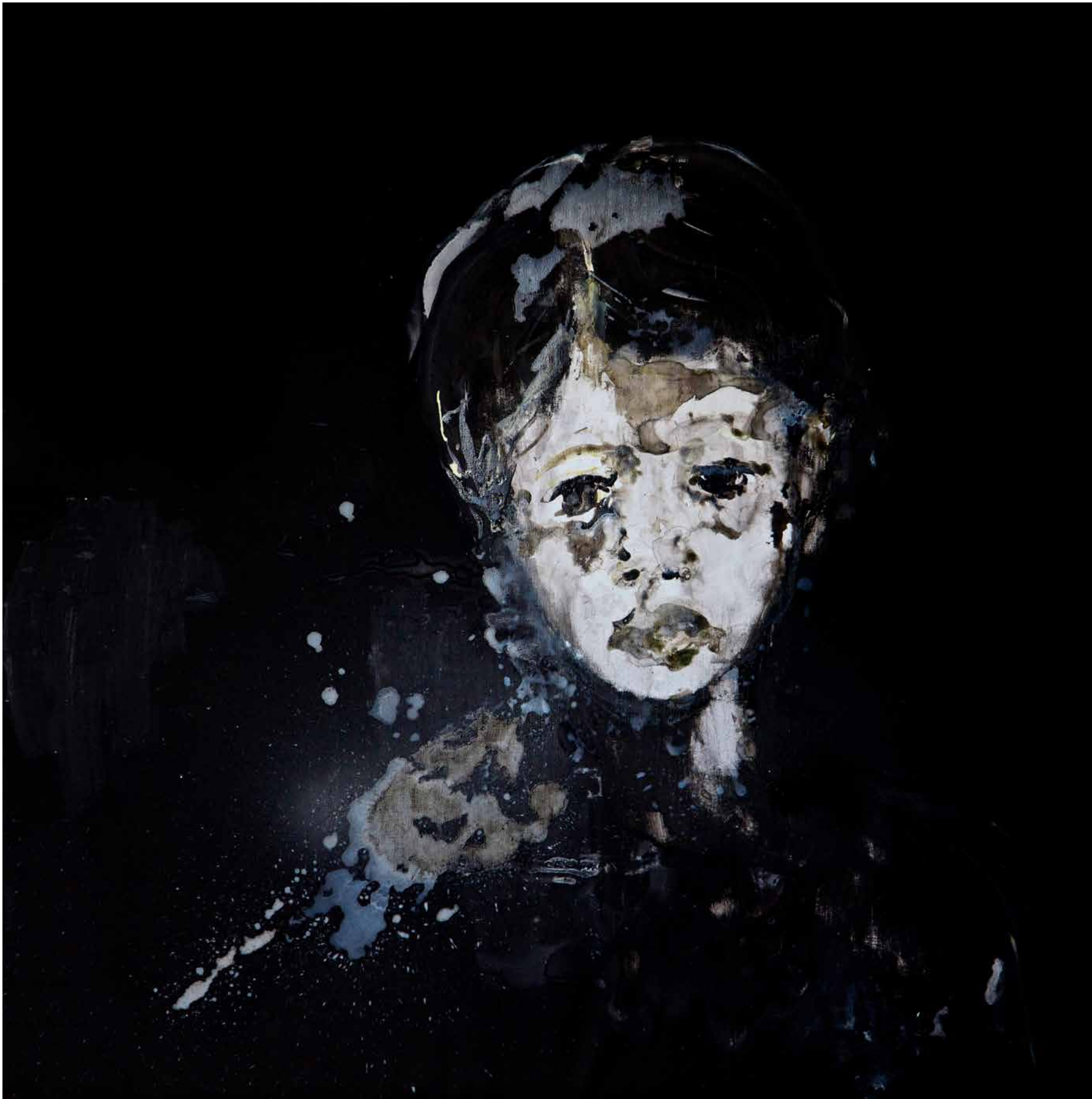
CAROLE, 2010, ink on canvas, dimensions : 80 x 80 cm

The Dolls series, representing ligatured dolls is a realization of the inherent difficulty in the true perception of body image and the complexity of the role of the weaker sex. The character is feminine, but without appeal. Laurence Le Constant disturbs the usual vision of standards, petrifying women as body-objects, dedicated to the omnipotence of male desire. The being is subjected to this state and if it refuses to live in this sexual envelope constrained to weakness and disenchantment, it finds that it cannot escape. Eyes or “l’œil” in reference to Georges Bataille, are, for the artist, the key elements of the display of overt sexuality over an inside doomed to powerlessness. Cracked, gaping, wounded, to become a woman is an impossible betrayal.