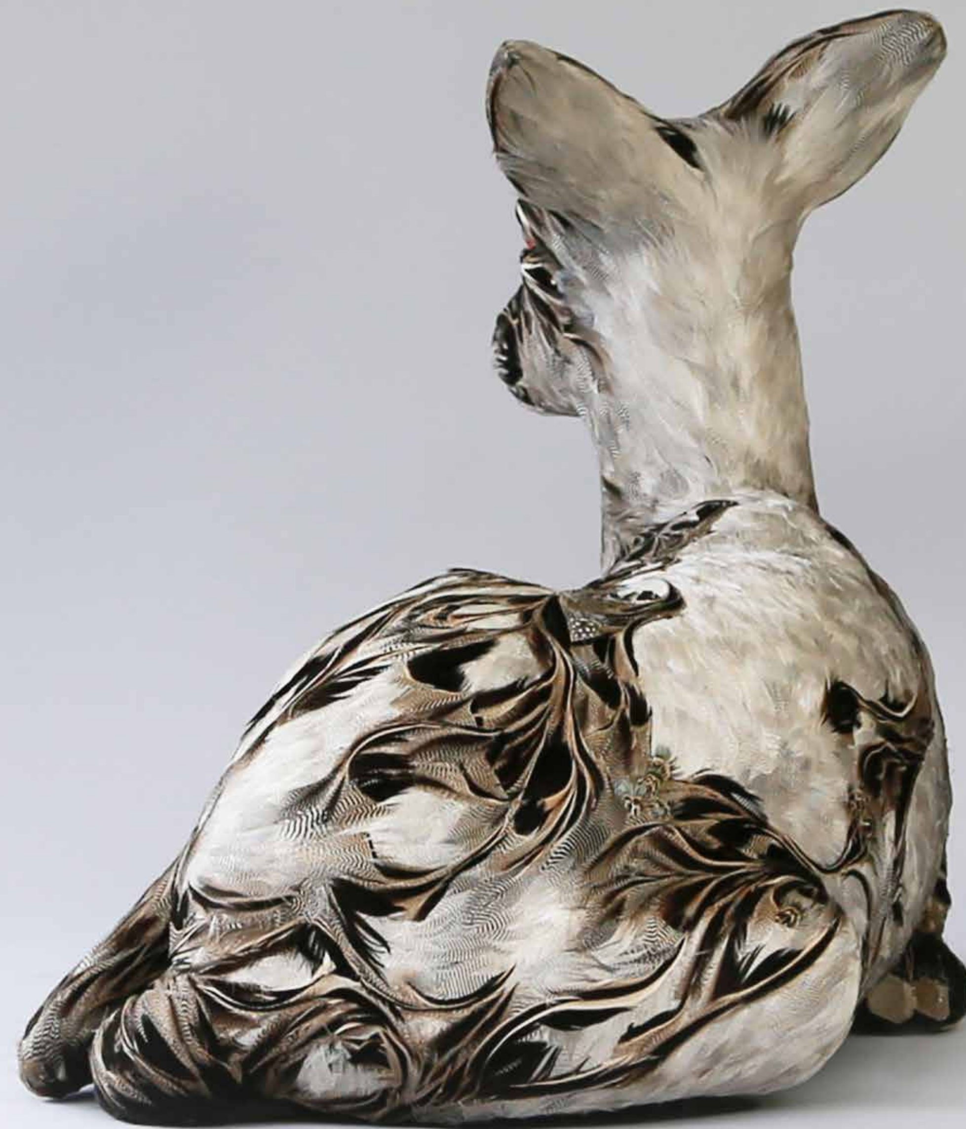
Sophia, 2019 - Unique Piece, 60 x H 40 x 29 cm. Glass, leather, white and smoky quartz crystals, duck and pheasant feathers on polyurethane and resin