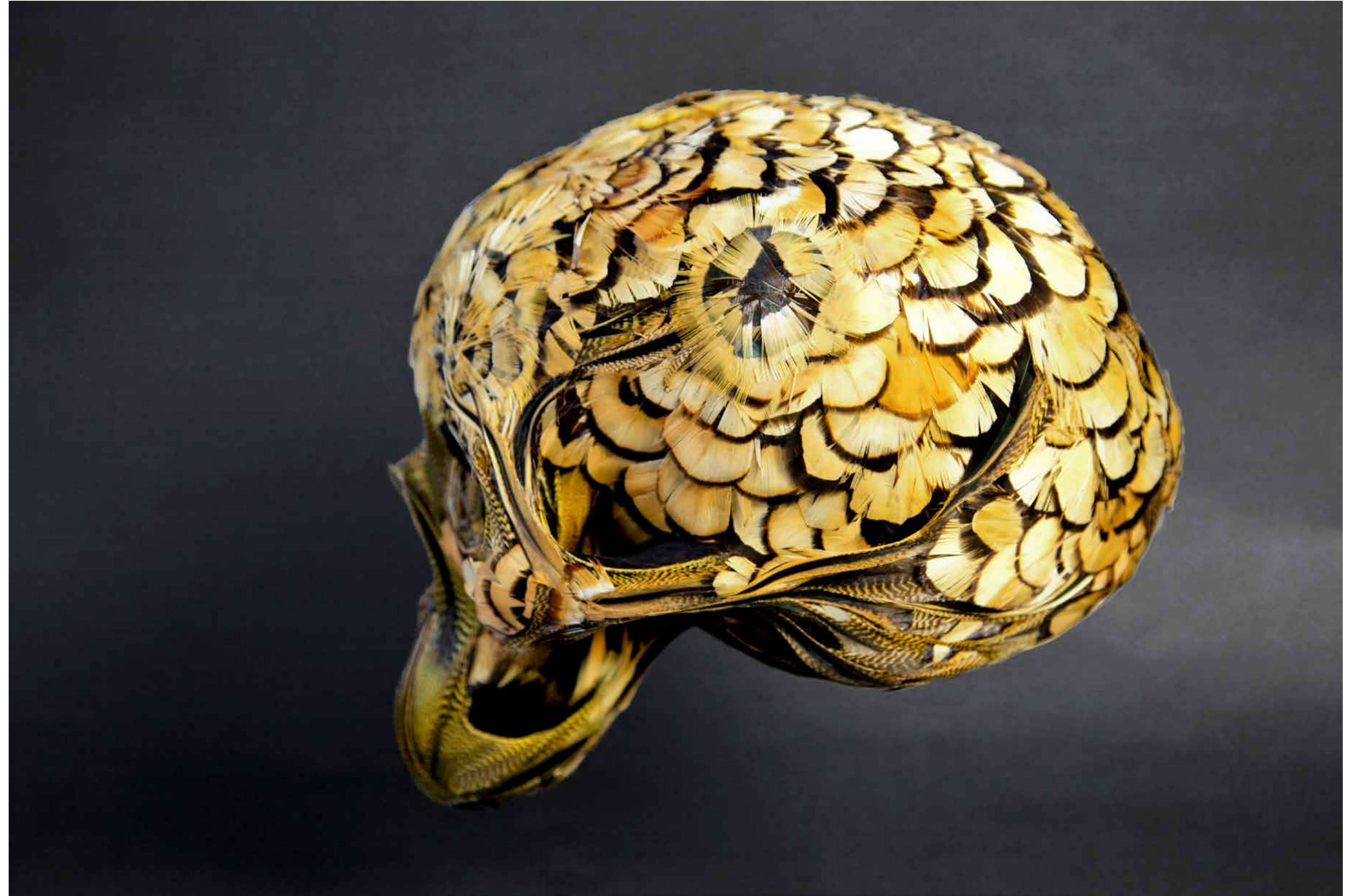
Marguerite, 2014 Pheasant and duck pheasant on resin sculpture - 24x14x22 cm