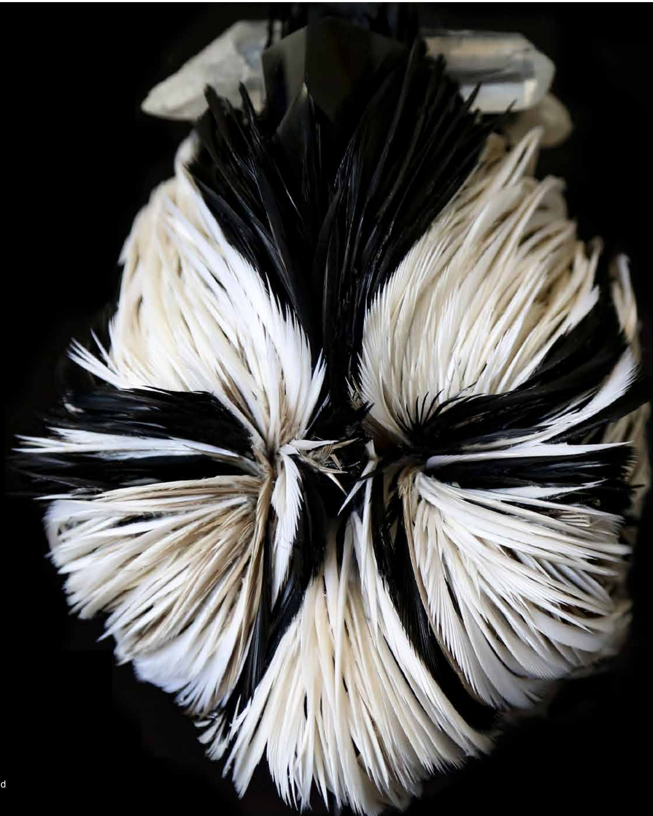
Sayuri, 2019 - Unique Piece, H 34 x 32 x 18 cm. Obsidian Blocks of Madagascar, rock crystal and goose feathers on resin