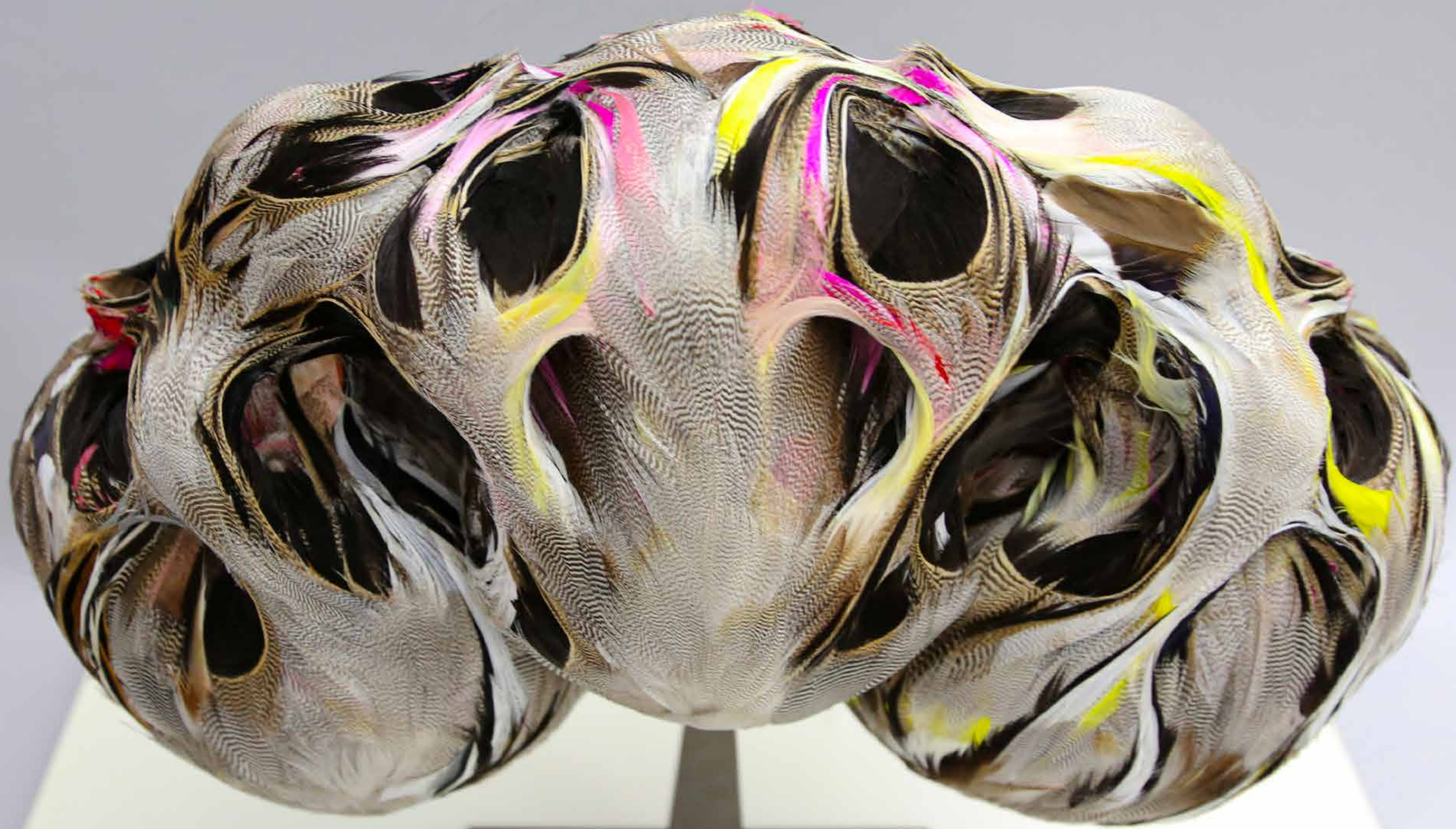
PASSAGE ALBEDO, (2022) H 38 x 40 x 16,5 CM Duck and pheasant feathers on resin skulls. Base in brass.