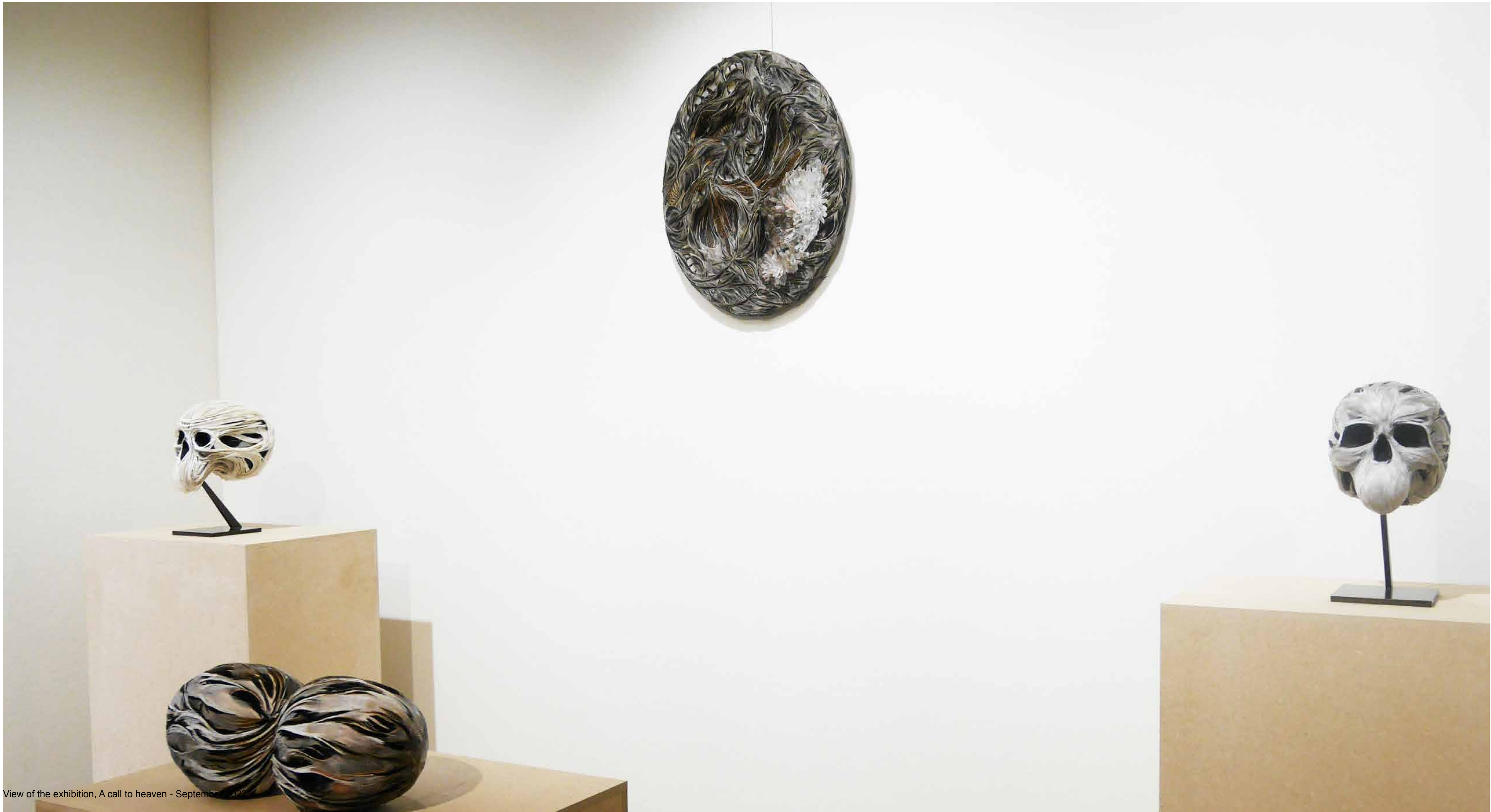
View of the exhibition, A call to heaven - September 2022