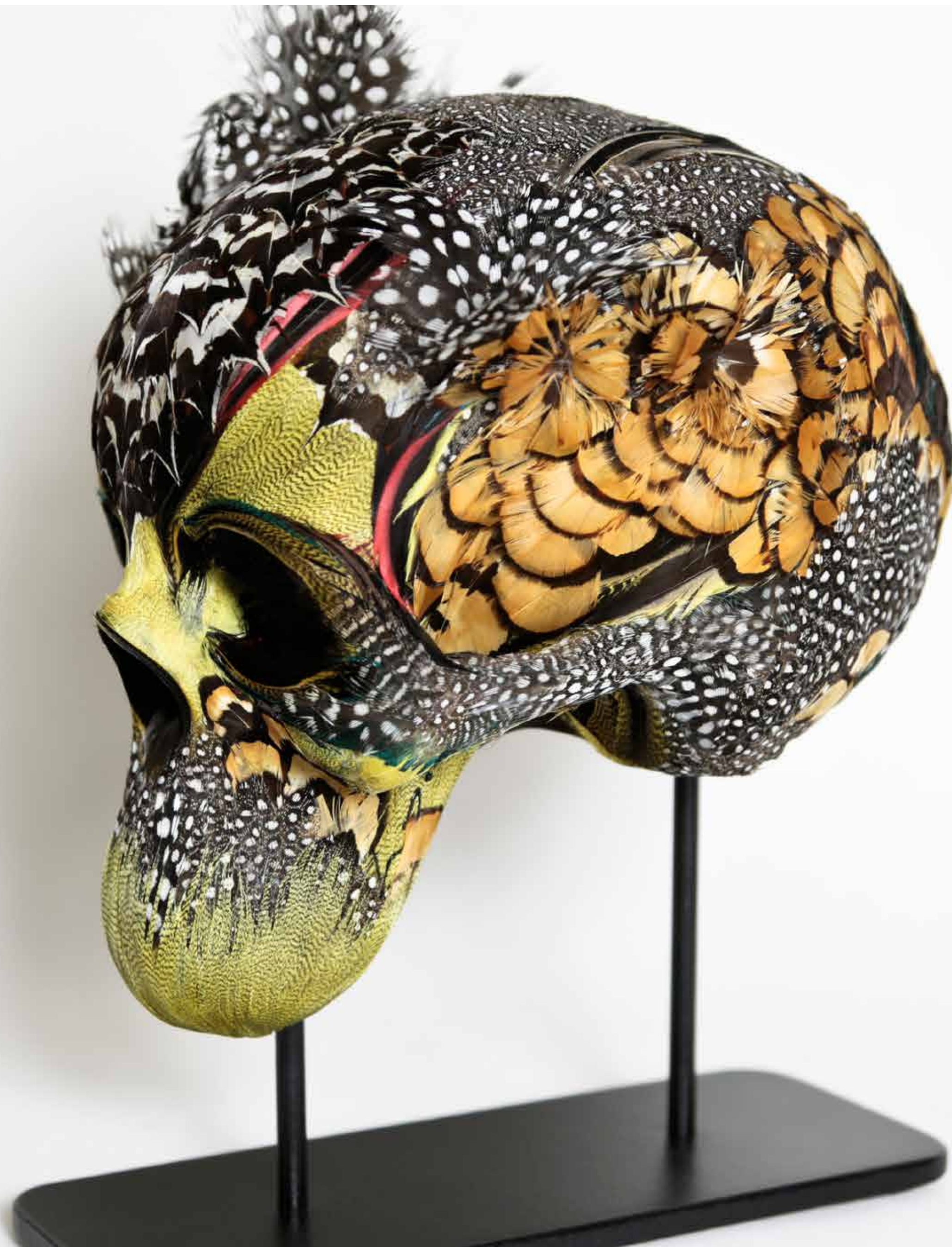
Mirella, 2015 Duck, guinea fowl and pheasant feathers on a resin skull, metal stand Dimensions : 23 x 14 x 20 cm