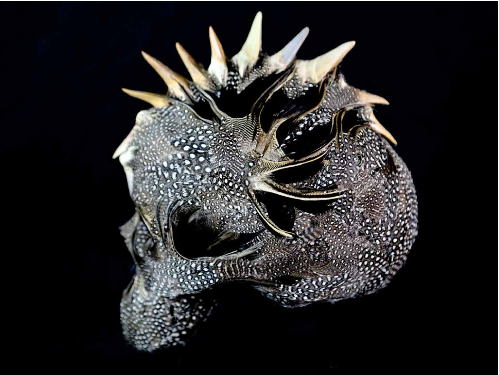
Janice, 2014 Duck, feasant feathers and shark teeth on a resin skull, métal stand - dimensions : 28 x 20 x 15 cm

The act of repairing is an integral part of Laurence Le Constant’s artistic process. This resolutely benevolent and emotional life force ennoble the damaged, the forgotten, and the useless. Prisca, Shakti, Nod arise from recovering damaged animal objects, suddenly brought to magnification, propelled into an animist world and summoning the supernatural. Animal, vegetable and mineral blend with a psychological representation of humanity. Turning the wheel of a Nordic tale in the symbolism of perpetual motion, the artist tries to achieve the ultimate fantasy of regeneration.