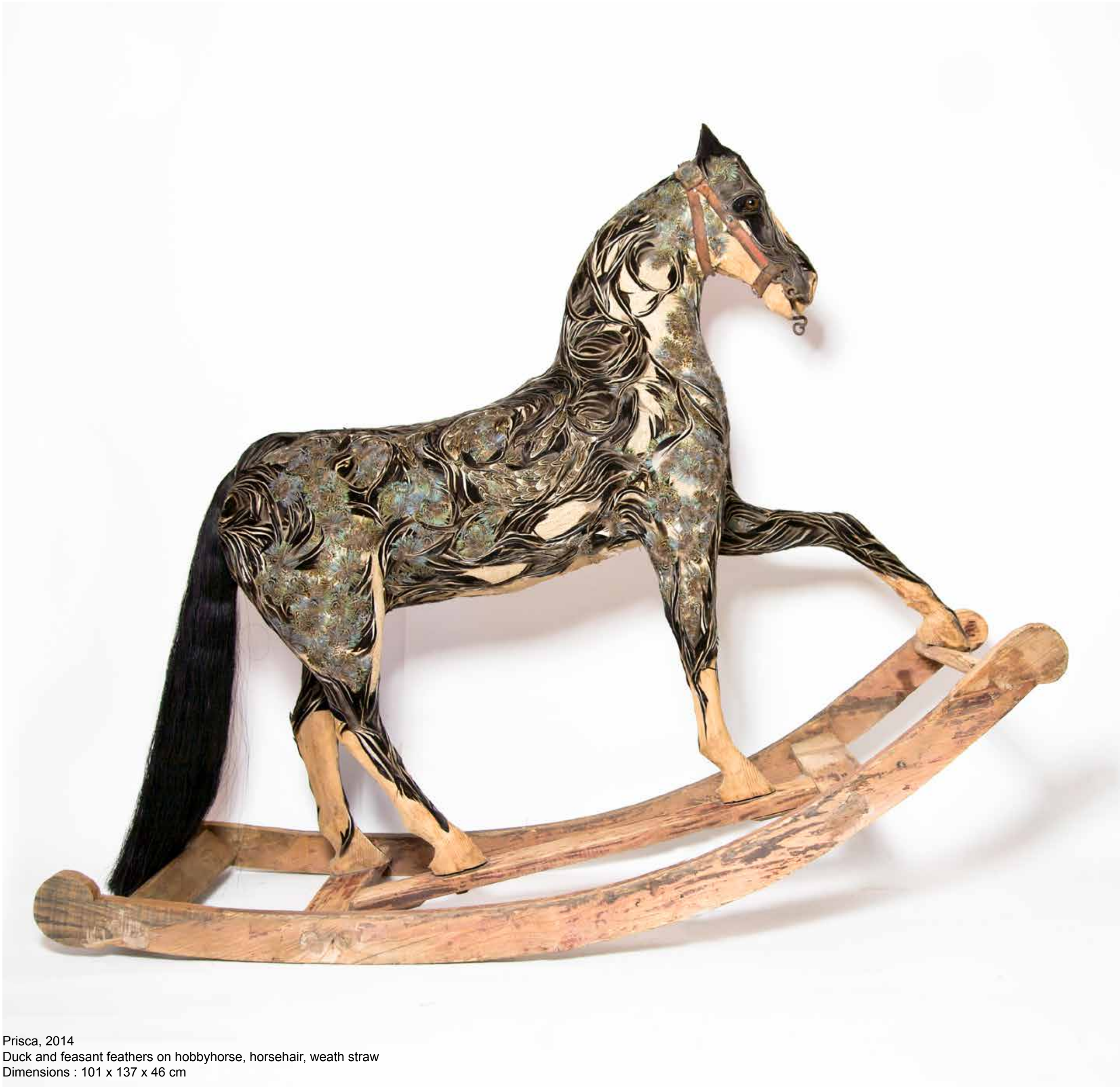
Prisca, 2014 Duck and feasant feathers on hobbyhorse, horsehair, weath straw Dimensions : 101 x 137 x 46 cm

The work of Laurence Le Constant sketches out the contours of a bewitching world, populated by singular hybrid figures. Childhood fantasies are revived, lulled by cosmic legends and tales from which she borrows many references. Both figurative and dreamlike scenes are presented in a multifaceted way. Situated in this vaporous gap between the imaginary and the real, the pieces created open onto essential metaphysical and identity questions.