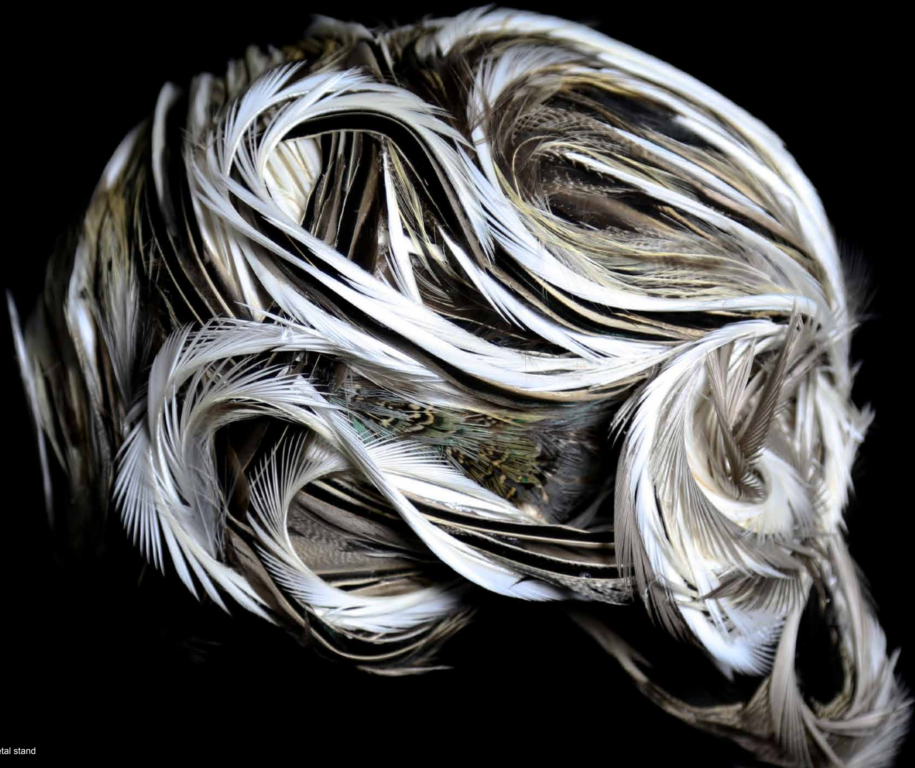
CELINE, 2014 goose and duck feathers on a resin skull, métal stand dimensions : 21 x 15 x 20 cm